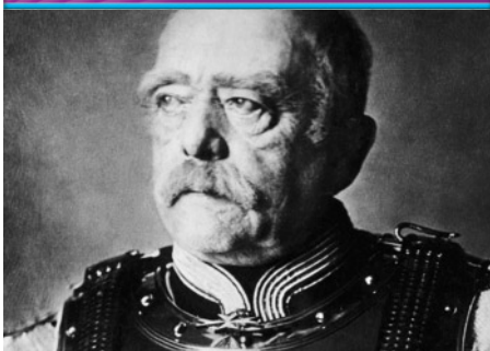
Otto von Bismarck 1815–1898

To some Germans, Bismarck was the greatest and noblest of Germany's statesmen. They say he almost single-handedly unified the nation and raised it to greatness. To others, he was nothing but a devious politician who abused his powers and led Germany into dictatorship.